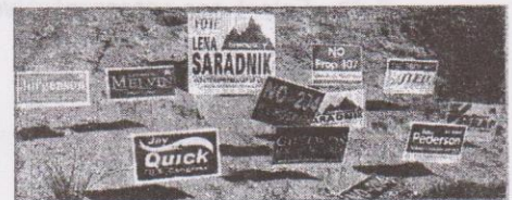
Campaign signs in Arizona.

You can see the influence of Greek democracy and the Roman Republic in the government we have today. Even in the 1700s, America was too big to work as a direct democracy. The Founding Fathers established a system that gave power to the people, and did so with elected representatives. The final product is called a representative democracy .