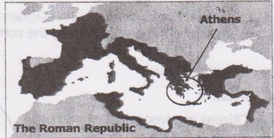
Athens was a city-state in ancient Greece. The Roman Republic covered almost all the land surrounding the Mediterranean Sea.

No one person invented the type of democracy that we have today. The building blocks were created in the classical period and developed over the centuries. The classical period covers the long history of the region that surrounds the Mediterranean Sea. Democracy was just one of the many different types of governments that the Greeks and Romans tried over the centuries. Political thinkers, including America's Founding Fathers, studied the history of these civilizations closely for lessons on government.