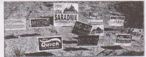
Campaign signs in Arizona.

You can see the influence of Greek democracy and the Roman Republic in the government we have today. Even in the 1700s, America was too big to work as a direct democracy. The Founding Fathers established a system that gave power to the people, and did so with elected representatives. The final product is called a representative democracy .