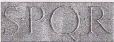
These letters are found all over Rome and represent "The Senate and People of Rome".

When citizens participate in government they give their permission for that government to operate. Participation includes doing government like in Athens, and voting for representatives like the Romans.