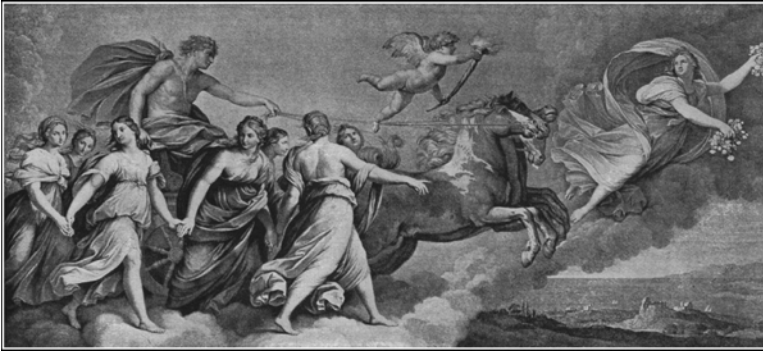
AURORA Guido Reni Rospigliosi Palace

I, boy as I am, could drive that splendid chariot! Then the boys would believe that I am really the child of the sun-god.”